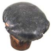
30-30 Winchester 160 gr. Evolution™ 200 yd. Bare Gelatin Max Temporary Cavity Diameter: 4.75"

Expansion: With higher retained energy downrange, the LEVEREVOLUTION hits hard and expands rapidly for deep, wide wound channels. Wound cavities are nearly 50% larger from the muzzle out to 250 yds. than with flat point bullets.